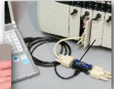
In-line RS-232 ComProbe II (Async).

Summary Pane one line overview of each data frame/message. Click to reveal detail.