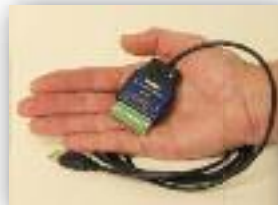
RS-422/485 ComProbe (Async).